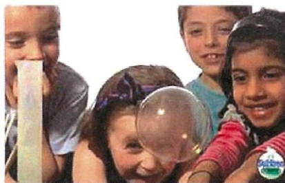
Loved by over 1 Million Children!